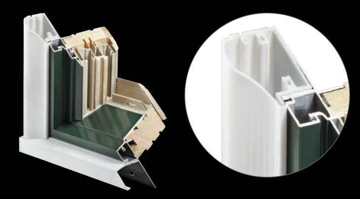
SOLID MODEL PROTOTYPE OF EXTERIOR TRIM AND SILL